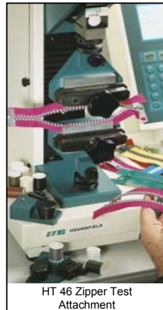
HT 46 Zipper Test Attachment