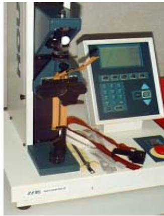
Photo 4 (S411 & S412) Open End Fastener Box Test Drg No. S411 & S412