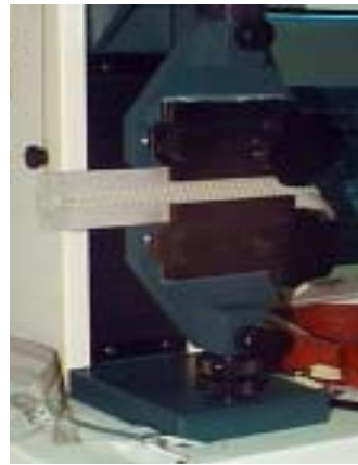
Photo 6 (S413) Lateral Strength Test HTE Drg No. S413 (Modified HT46)