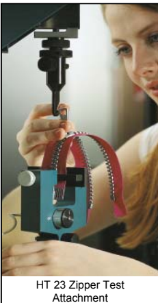
HT 23 Zipper Test Attachment

(other attachments also available - consult factory with details)