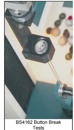
BS4162 Button Break Tests