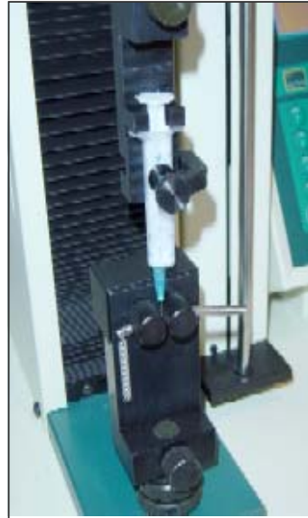
NEEDLE HOLDER PULL-OFF