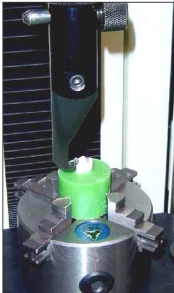
DENTISTRY BRACE PULL-OFF