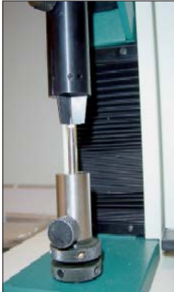
TUBULAR RING SLIP

MEDICAL INDUSTRY, EXAMPLES OF TINIUS OLSEN GRIPS