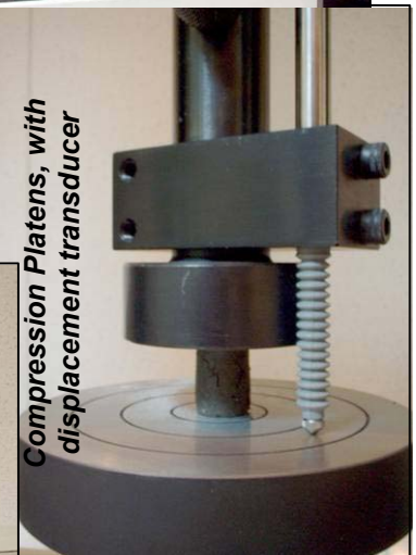
Compression Platens, with displacement transducer