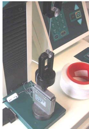
HT58 Bottom Grip with 5N Loadcell and Damper Attachment