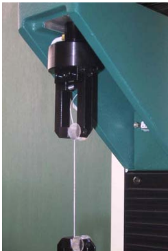
HT58 Top Grip