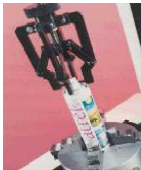
Pull off Test of Atomiser