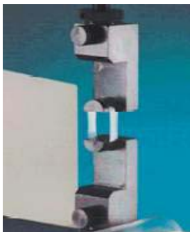
Tensile Test of Canister linia