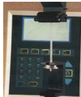
Pull off Test of delivery tube