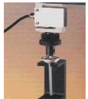
Push test of delivery tube