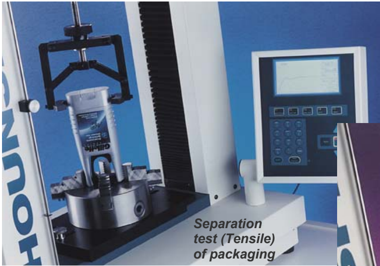
Separation test (Tensile) of packaging

Depending upon the customer's requirements, Tinius Olsen can design and manufacture grips and attachments for many different applications and testing needs. Consult factory or representative for further information.